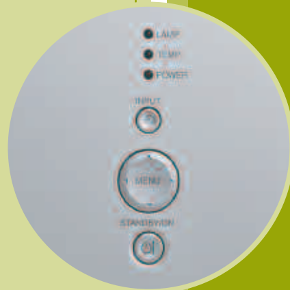
Multi Function Controls