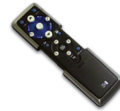
Premium wireless remote control with USB L1631A

The lightweight and sturdy design allows you to take it wherever you need to present.