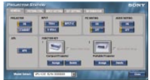
PROJECTOR STATION version 2.0

* PROJECTOR STATION version 2.0 software requirements: Microsoft® Windows® 98, Windows® 98 SE or Windows® 2000 operating system.