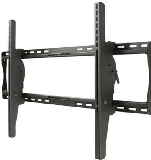
Mount PDW T XL-2 side view