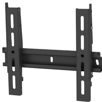
PDW T XS front view

Solid universal wall mount with fixed tilt for NEC displays from 17inch up to 32inch. It can, furthermore, be locked by a locking pin or padlock for improved personal safety and security from theft.