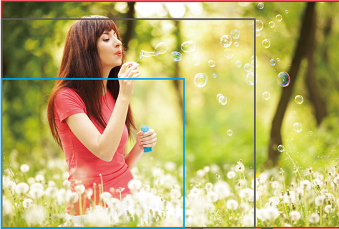
SVGA 800X800 pixels