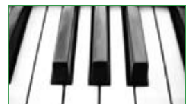
2500:1 contrast ratio