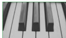
1000:1 contrast ratio

Technology from Texas Instruments produces a stunning 2500:1 contrast ratio for pin sharp graphics and crystal clear text. Crisper whites, ultra-rich blacks makes images come alive and text easier to read - ideal for business and education presentations.