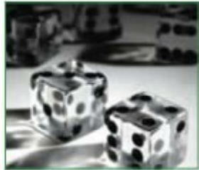
20,000:1 Contrast Ratio