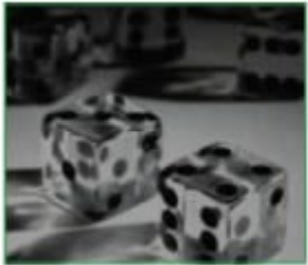
2000:1 Contrast Ratio

Add more depth to your image with a high contrast projector; with brighter whites and ultra-rich blacks, images come alive and text appears crisp and clear - ideal for business and education applications.