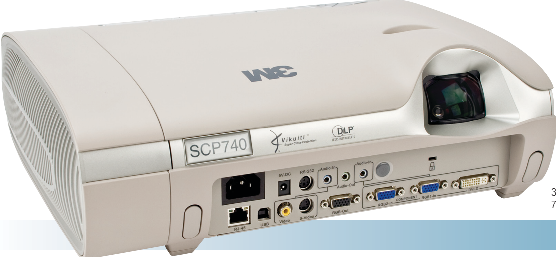
3M SCP740 Projector 78-9236-6999-4

For the ideal projected image to match the latest in WXGA notebooks and popular video formats, the 3M Super Close Projection System SCP740 is the solution you need. The first high brightness, WXGA projector to be available with super close projection technology, the SCP740 has the benefits of DLP™, Brilliant Color™ DVI-D connectivity and an integrated wind tunnel for fan noise reduction. Works better than traditional ceiling mounted projectors because the extreme off-axis short throw reduces light in the presenter's eyes and the full connectivity makes it the perfect tabletop media hub tool!