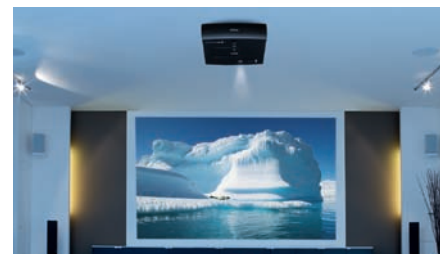
Enjoy the ultimate cinema experience at home

Equipped with two HDMI inputs (version 1.3), the Epson EH-TW5000 is designed for you to benefit from High Definition broadcast and digital multimedia. Play Blu-ray and DVD movies; connect the latest HD games console or HD set top box.