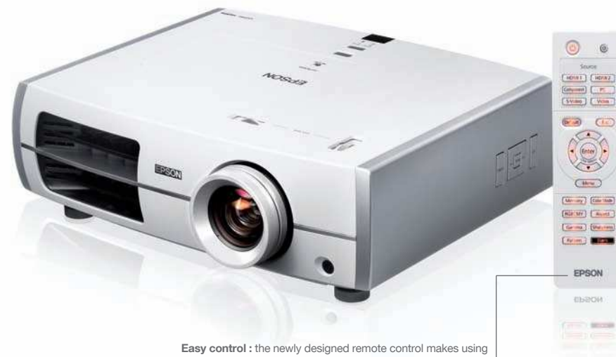
Easy control: the newly designed remote control makes using the EH-TW3800 even easier. Sit back, relax, and take advantage of all the power and functions of this projector.

With its great connection flexibility the Epson EH-TW3800 can function at the centre of all your high definition and latest-generation multimedia devices. Play Blu-ray and DVD movies; connect a set top box, a games console, digital TV tuner, PC or digital camera.