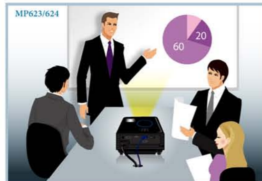
Focus on the presentations. Free from noises!