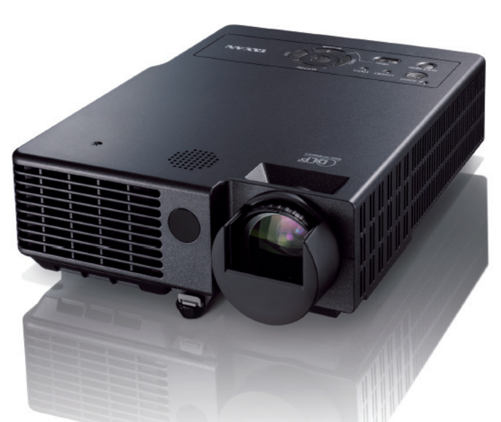
The Smallest Ever 2500lm Projector.* Wireless and PC-less, Too.