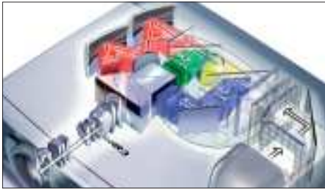
The new Canon optical box (illustrated above) is designed to provide excellent color reproduction quality.

The core of the LV-X1 is a newly developed optical box that contains Canon advanced technology. The optical box is the key component of any projector, responsible for processing light within the unit. By using a more efficient process than conventional models, the LV-X1 offers superior color fidelity for all your projection needs.