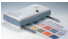
PR-200S Presentation Assistant

Many different devices and systems are supported, including both Windows and Mac platforms. During presentations, the optional PR-200S can be connected for on-the-fly scanning and projection. Component Video input is available for high-quality display of DVD and HDTV video content.