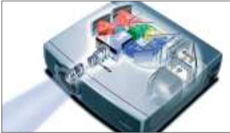
The new Canon optical box (illustrated above) is designed to provide excellent color reproduction quality.

The core of the LV-S1 is a newly developed optical box that contains Canon advanced technology. The optical box is the key component of any projector, responsible for processing light within the unit. By using a more efficient process than conventional models, the LV-S1 offers superior color fidelity for all your projection needs.