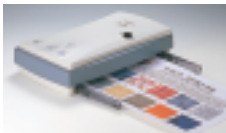
PR-200S Presentation Assistant

Many different devices and systems are supported, including both Windows and Mac platforms. During presentations, the optional PR-200S can be connected for on-the-fly scanning and projection. Component Video input is available for high-quality display of DVD and HDTV video content.