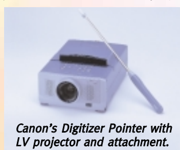
Canon's Digitizer Pointer with LV projector and attachment.

Canon's new Digitizer is a pointer/wireless mouse that works with your Canon LV-7325/20 projector and lets you stand in front of