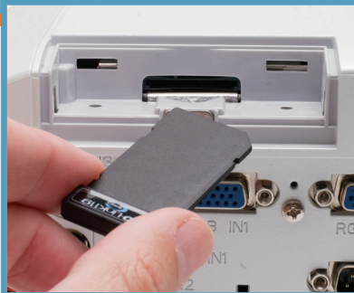
SD Card Slot Cover (SD Card Slot is inside)