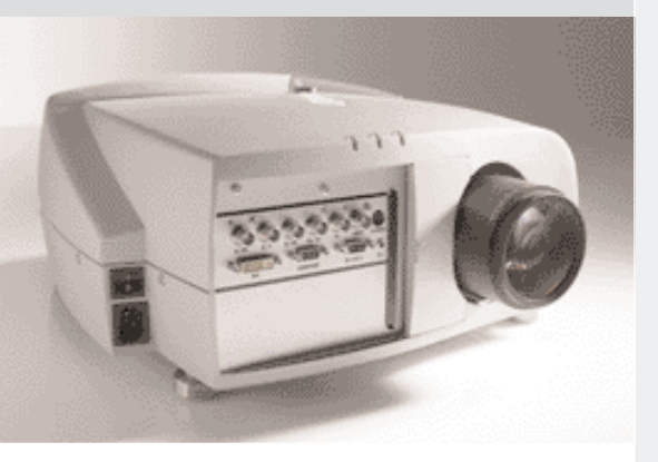
MGP 15 projector