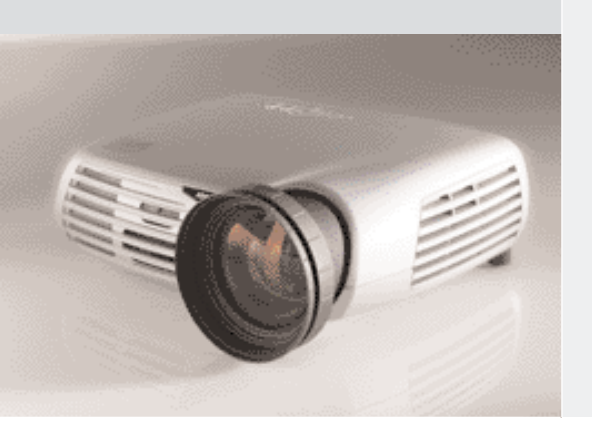
MGP D5 projector