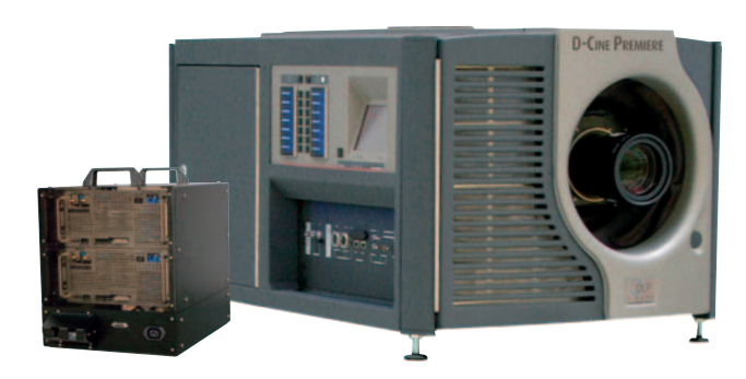
Barco's D-Cine Premiere DP90 (comes with separate powerbox)

All D-Cine Premiere projectors are fully compatible with Barco's D-Cine Communicator, the industries' most advanced projector control & diagnostics software , designed to answer the needs of both theatre owners and the post production community. For more information, refer to separate brochure.