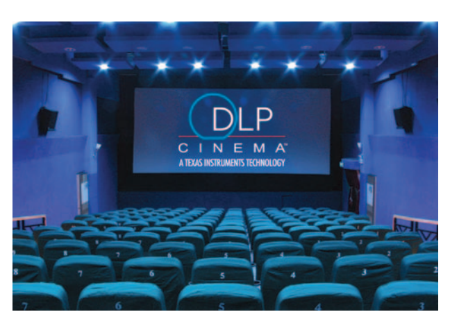
Hongxing Cinema, Nanning, China