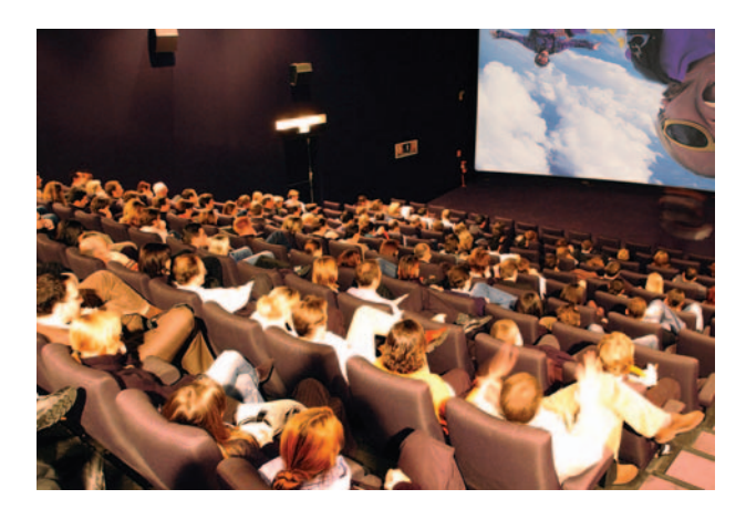
Kinepolis, Brussels, Belgium

Being fully compatible with Barco's D-Cine Communicator, the industries' most advanced projector control and diagnostics software, the DP100 simply is the perfect tool to answer the demanding needs of the digital cinema industry.