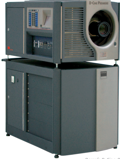
Barco's D-Cine Premiere DP100 (two-piece construction with projector head on top of server rack containing

June 2005: already more than 200 installations worldwide!