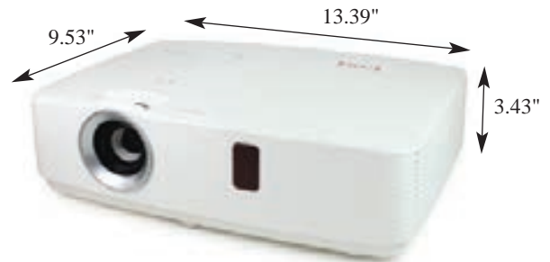
EK-103X • XGA • 3LCD projector.

HDMI Digital connectivity with HDCP compliance. Side-accessed air filter & top accessed lamp for ease of maintenance. Fixed image offset. Automatic vertical digital keystone correction.