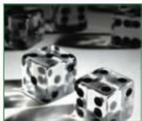
20,000:1 Contrast Ratio