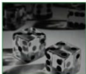
2000:1 Contrast Ratio

Add more depth to your image with a high contrast projector; with brighter whites and ultra-rich blacks, images come alive and text appears crisp and clear - ideal for business and education applications.