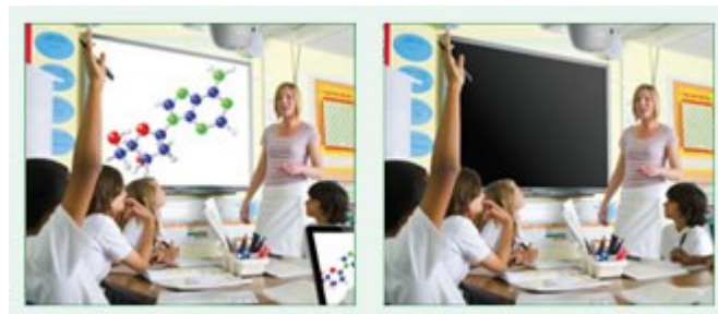
Eco AV mute off 100% power consumption

Stay in control of your presentation with Eco AV mute. Direct your audience's attention away from the screen by blanking the image when no longer needed. This also reduces the power consumption by up to 70%, further prolonging the life of your lamp.