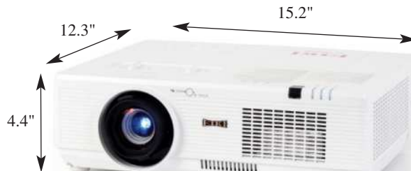
LC-WBS500 • WXGA projector. LC-XBS500 • XGA projector.