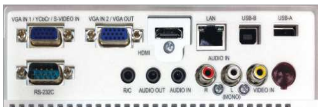
Includes a full complement of connections, including network control.

EIKI® is a registered trademark of EIKI International, Inc. Kensington® is a registered trademark of ACCO Brands Corporation.