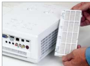
Handy access to air filter.