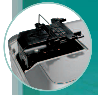
Easy Lamp Access