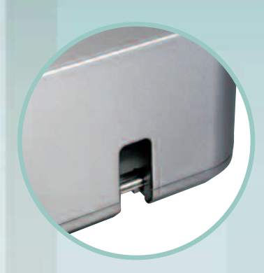
Anti Theft Security Bar

Legavisual.com Kft 3300 Eger Szarvas G. u. 7 Tel: 36 36 510 500 Fax: 36 36 510 501 e-mail: info@legavisual.com www.legavisual.com