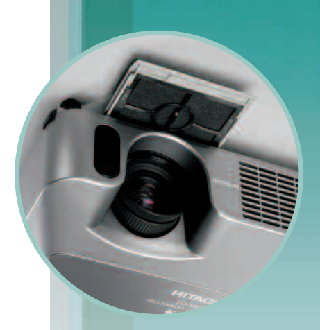
Easy Filter Access