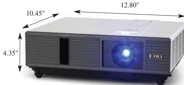
LC-WNB3000NA • WXGA projector.