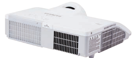
Back 3/4 View