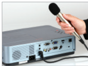
Built-in 10 Watt sound system.

Includes a full complement of connections, including network control.