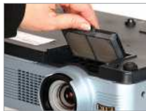
Handy access to air filter.