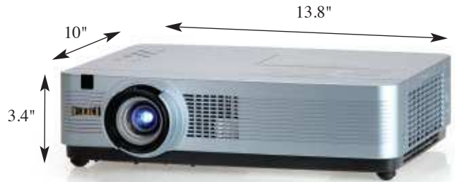
LC-WB200 • WXGA projector

Includes a full complement of connections, including network control.