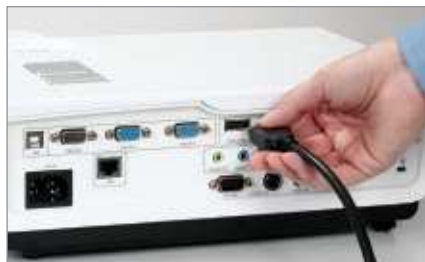
Connect and project.