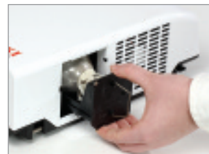
Side-accessed long life lamp.