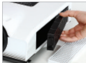
Side-accessed long life air filter.