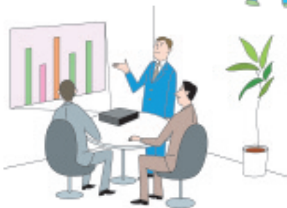
Small conference rooms