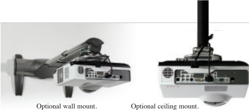
Optional wall mount.