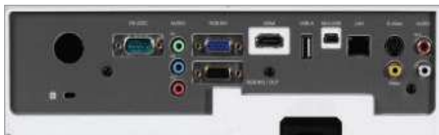
Includes a full complement of connections, including network control.

EIKI® is a registered trademark of EIKI International, Inc. Kensington® is a registered trademark of ACCO Brands Corporation.