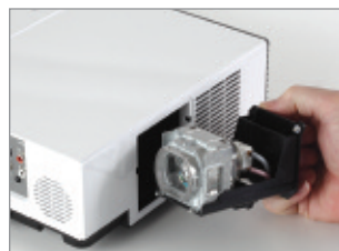
Easy to change long-life lamp.