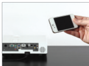
Wireless access with mobile terminal.