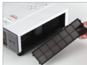
Handy access to air filter.