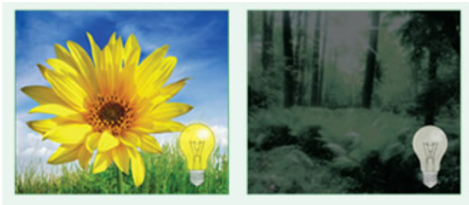
Bright scene ~ 100% power consumption

Dynamically adjusts the brightness and power consumption