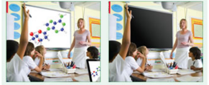
Eco AV mute off 100% power consumption

Stay in control of your presentation with the Eco AV mute feature. Direct your audience's attention away from the screen by blanking the image when no longer needed. This also instantly reduces the power consumption to 30%, further prolonging the life of your lamp