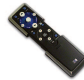
Premium wireless remote control with USB L1631A

The lightweight and sturdy design allows you to take it wherever you need to present.