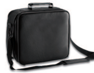
Carrying case L1674A

Easily connect to a wide range of video equipment, from a VCR to a camcorder.