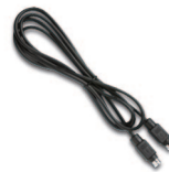
6-foot S-video cable L1635A

Lightweight and easy to carry with a built-in handle, this mobile screen sets up easily anywhere you need it.