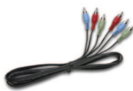
HDTV component cable (RGB) L1634A

Always have a back-up lamp module for your presentations.