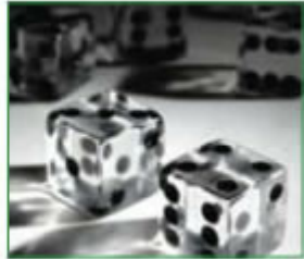
15,000:1 Contrast Ratio