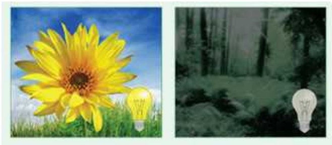
Bright scene ~ 100% power consumption

Dynamically adjusts the brightness and power consumption