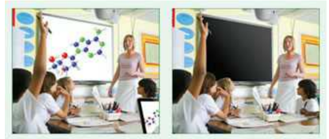
Eco AV mute off 100% power consumption

Stay in control of your presentation with the Eco AV mute feature. Direct your audience's attention away from the screen by blanking the image when no longer needed. This also instantly reduces the power consumption to 30%, further prolonging the life of your lamp.