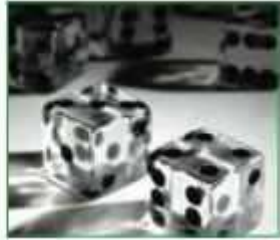
15,000:1 Contrast Ratio