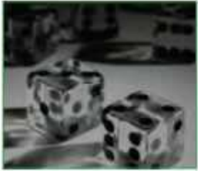
2000:1 Contrast Ratio

Bright 2600 ANSI Lumens, Perfect for projecting in lights on environments. And with DarkChip3™ technology from Texas Instruments combined with Eco+ technology produces a stunning 15,000:1 contrast ratio for pin sharp graphics and crystal clear text. Crisper whites, ultra-rich blacks make images come alive and text easier to read - ideal for business and education presentations.