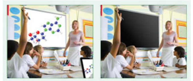
Eco AV mute off 100% power consumption

Stay in control of your presentation with the Eco AV mute feature. Direct your audience's attention away from the screen by blanking the image when no longer needed. This also instantly reduces the power consumption to 30%, further prolonging the life of your lamp.