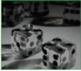
2000:1 Contrast Ratio