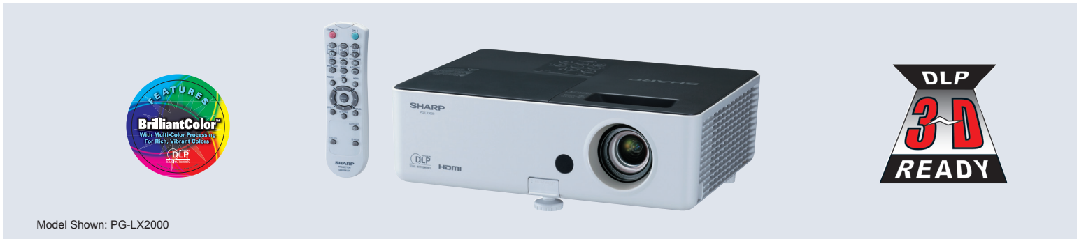
Model Shown: PG-LX2000

Portable and affordable, these 3D Ready BrilliantColor™ DLP® projectors deliver high image quality and superb reliability for classroom, meeting room and small office use. With 2,800 lumens and 2,000:1 contrast ratio, these models provide exceptionally vibrant and realistic image reproduction. The sealed DLP chip with filter-free design helps ensure low maintenance and operating costs. Built in an ISO 14001 certified factory with standby power consumption as low as 0.5W and estimated lamp life of up to 5,000 hours (in eco mode), these lightweight RoHS compatible projectors are an environmentally conscious choice.