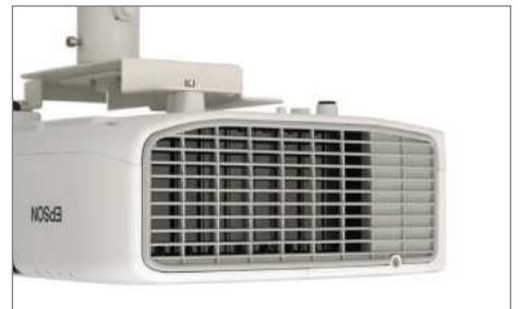
EB-D6250 with exhaust shutter system