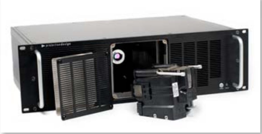
The Remote Light Source illumination component is rack mountable, and can be installed in a standard 19" rack up to 30 metres away from the projection head.

The projectiondesign FR12 RLS™ series of projectors are truly revolutionary. Building upon the successful F12 series projectors, the FR12 RLS employs the new Remote Light Source technology to remove the lamp from the projector, creating a near-silent projection head that can be used in a range of applications with noise-free operation and simplified maintenance.