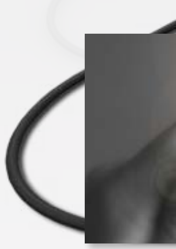
The Liquid Light Guide conto the Remote Light Source

The Liquid Light Guide (LLG) connects the FR12 to the Remote Light Source. The LLG is filled with a pure water-based liquid which efficiently transmit light from the RLS to the FR12. The LLG is available in three installation-ready configurations 10, 20 and 30 metre in length, which means that the FR12 projection