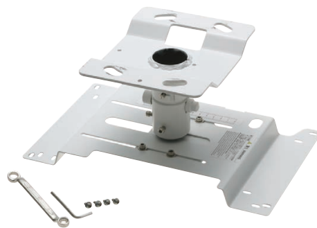
Tailor-made ceiling mount for easy installation and security