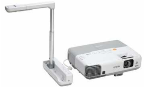
Share 3D objects using the ELP-DC06 document camera