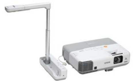
Share 3D objects using the ELP-DC06 document camera

For further information please contact your local Epson office or visit www.epson-europe.com