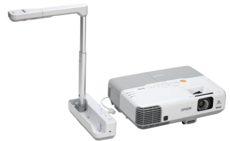
Share 3D objects using the ELP-DC06 document camera