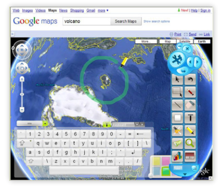
WizTeach InFocus Edition software