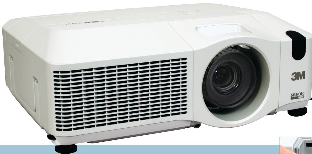
3M Digital Projector X95i 78-9236-7708-8

The 3M Digital Projector X95i offers a brightness of 5,000 ANSI lumens, a 1000:1 contrast ratio and XGA resolution. It uses inorganic LCD panels, which feature a higher resistance to light. This translates into longer operational life for the projector, and better picture quality during its life. It also features a new hybrid filter that operates for at least 4000 hours under normal conditions and enabling huge savings in maintenance costs over the lifetime of the projector. The X95i is designed for installations in mid to large sized venues such as conference rooms and lecture auditoriums as well as digital signage and public displays. Wide-range lens shift capabilities make for easy placement in virtually any environment.