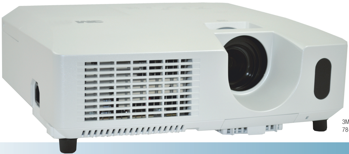
3M X31 Projector 78-9236-7723-7

The 3M Digital Projector X31 features 2,700 lumens of brightness and a 2000:1 contrast ratio for exceptional picture quality. Backed by the 3M brand for superior performance and reliability, the X31 features network functionality which allows effective management of assets to reduce cost of ownership, limit downtime and avoid unnecessary maintenance. Coupled with a new hybrid filter that operates for up to 4,000 hours under normal conditions the X31 is ideal for education and business organisations who are looking for minimal running costs over the lifetime of the projector.