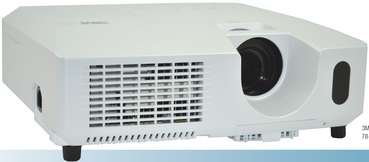
3M X36 Projector 78-9236-7724-5

The 3M Digital Projector X36 features 3,200 lumens of brightness and a 2000:1 contrast ratio for exceptional picture quality. Backed by the 3M brand for superior performance and reliability, the X36 features network functionality which allows effective management of assets to reduce cost of ownership, limit downtime and avoid unnecessary maintenance. Coupled with a new hybrid filter that operates for up to 4,000 hours under normal conditions the X36 is ideal for education and business organisations who are looking for minimal running costs over the lifetime of the projector.