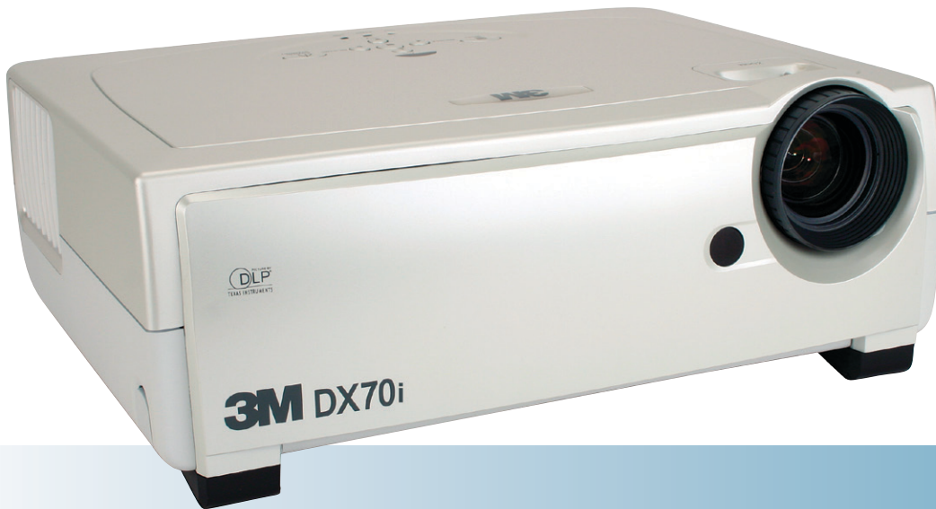
3M DX70i Projector 78-9236-7706-2

With the 3M Digital Projector DX70i utilizing the DarkChip3 DLP Technology your projected image will take on a whole new level of WOW! The 3M DX70i Digital Projector delivers exceptionally bright, crisp images, vibrant color and brightness uniformity.