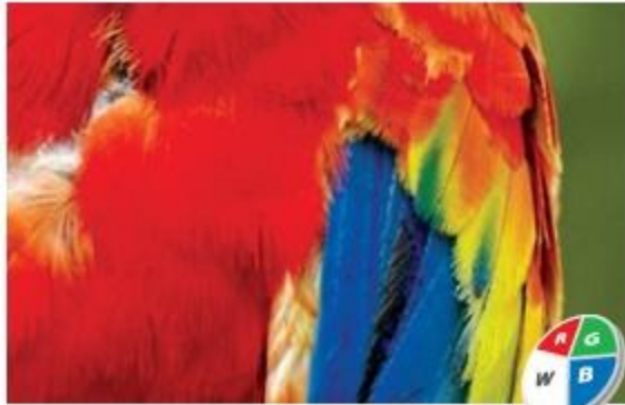
4 SEGMENT COLOR