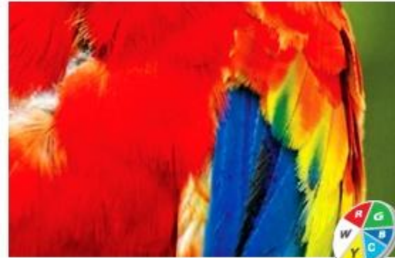
6 SEGMENT COLOR