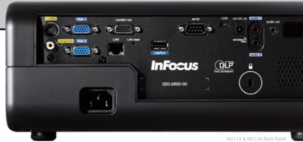
IN2114 & IN2116 Back Panel