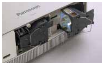
Lamps can be easily replaced.

The PT-L6600U/UL and PT-L6510U/UL feature a symmetrical design that places the