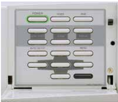
Control panel (Photo shows the PT-L6600U/L6510U. Controls of the PT-L6600UL/L6510UL are slightly different.)

The display resolution of the PT-L6600U/L6600UL is 1366 x 1024 pixels. Input signals other than SXGA (1280 x 1024 pixels) will be converted to 1366 x 1024 pixels. When the input signal is SXGA (1280 x 1024 pixels), it will be projected as it is without being converted. The display resolution of the PT-L6510U/L6510UL is 1024 x 768 pixels. If the display resolution indicated in the above data does not match this resolution, the input signal will be converted to 1024 x 768 pixels.