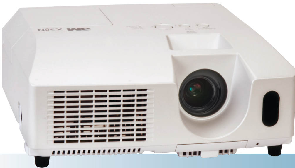
3M X30N Projector 78-9236-7714-6

The 3M Digital Projector X30N features 2,600 lumens of brightness and a 2000:1 contrast ratio for exceptional picture quality. Backed by the 3M brand for superior performance and reliability, the X30N features network functionality which allows effective management of assets to reduce cost of ownership, limit downtime and avoid unnecessary maintenance. Coupled with a new hybrid filter that operates for up to 4,000 hours under normal conditions, the X30N is ideal for education and business organizations who are looking for minimal running costs over the lifetime of the projector.